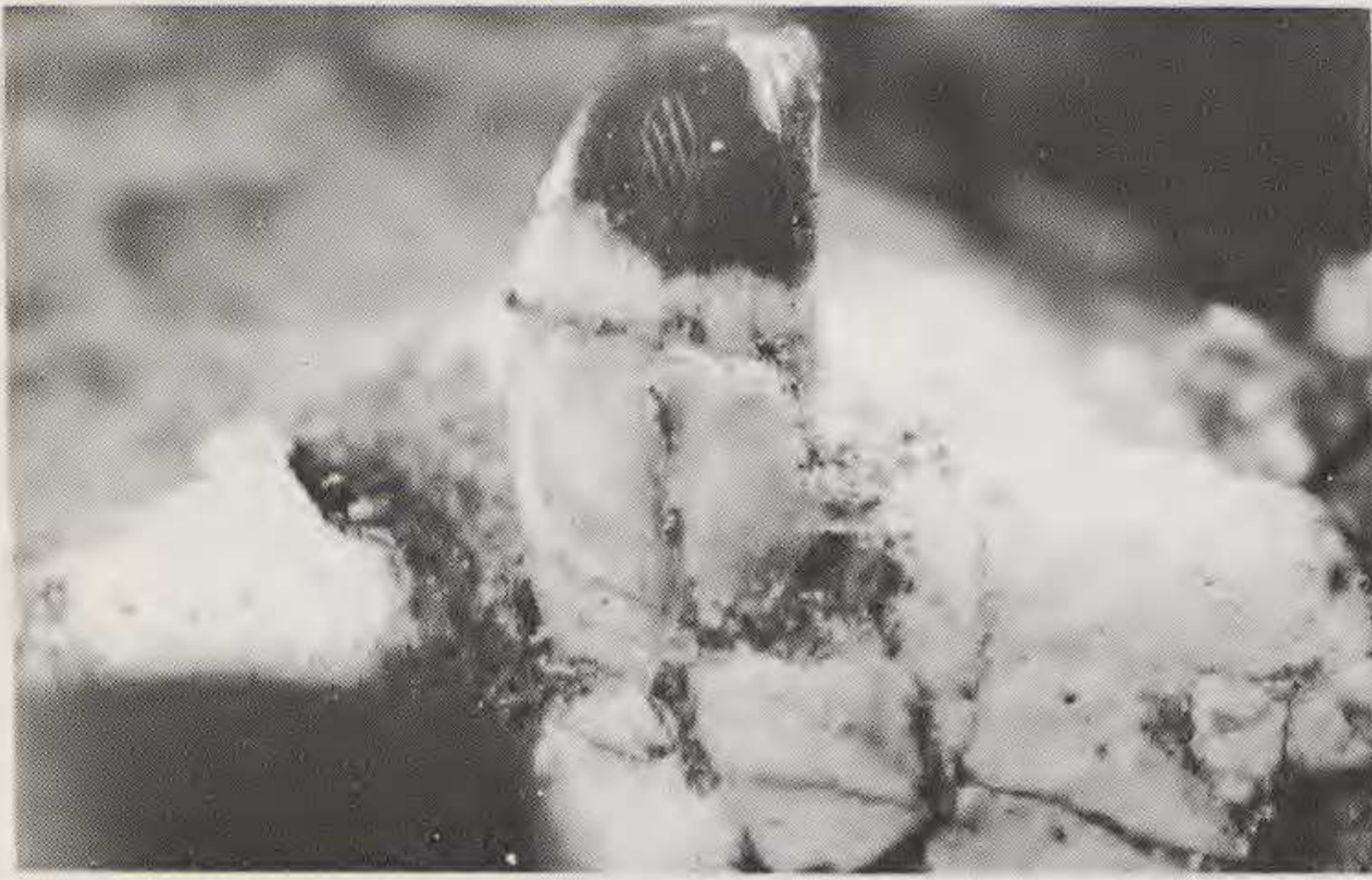
Fig. 2 Lateral view of canine of the holotype of Alocodon atopum , YPM 30790.

two tiny single-rooted premolars, now indicated only by indistinct alveoli which are circular in cross-section. When the specimen was first studied by one of us (T.M.B.) in 1972, the crown of P 1 was present, but was later lost. It was simple and bulbous with no cingula or cristae. The shape and outline of the cross-section of the root of P 2 is like that of P 1 , and presumably its crown was similar (see Fig. 3).